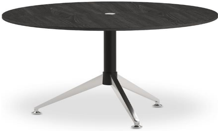
Table for One Person Qty-05