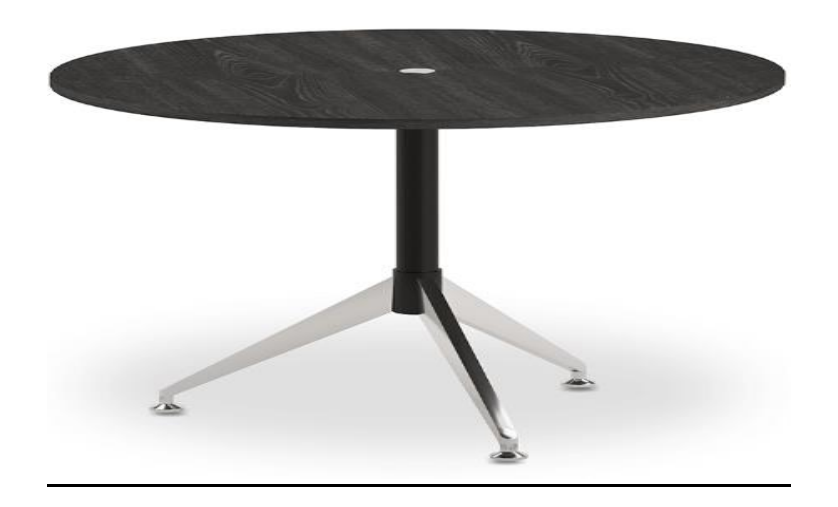
Table for One Person Qty-05